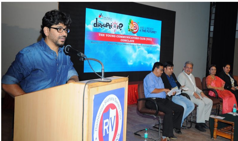
Actor-director Pavan Kumar speaking on the occasion of Youth Communicators Club (YCC) conclave in Bengaluru.

In fact, the scale of 'disruption' can be both small as well as large, which was well reflected by actor-director