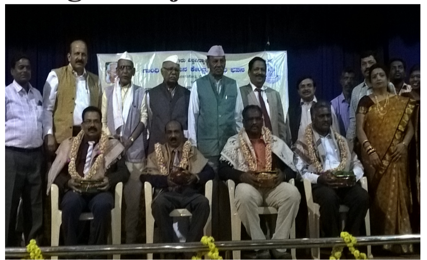
Dignitaries being honored on the occasion of Gandhi bhavan's golden jubilee commemoration

He further extolled scholars and students to inculcate Gandhian philosophy and principles, and build a con-