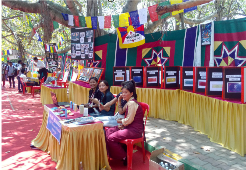
Tibet Day being observed in Manasagangotri, University of Mysore.