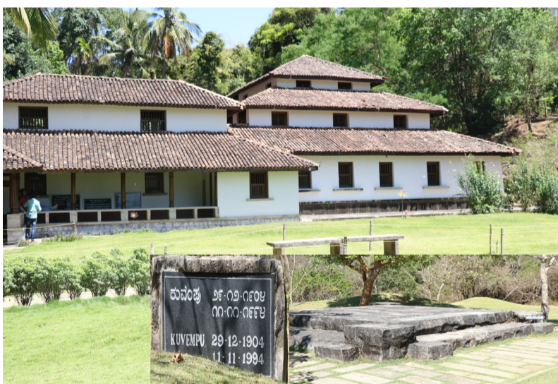
Kavimane - Kuvempu's childhood home; Inset is Kuvempu's Memorial

Kollur's Mookambika temple in Udupi district, a famous Hindu pilgrim center, marked our next visit before