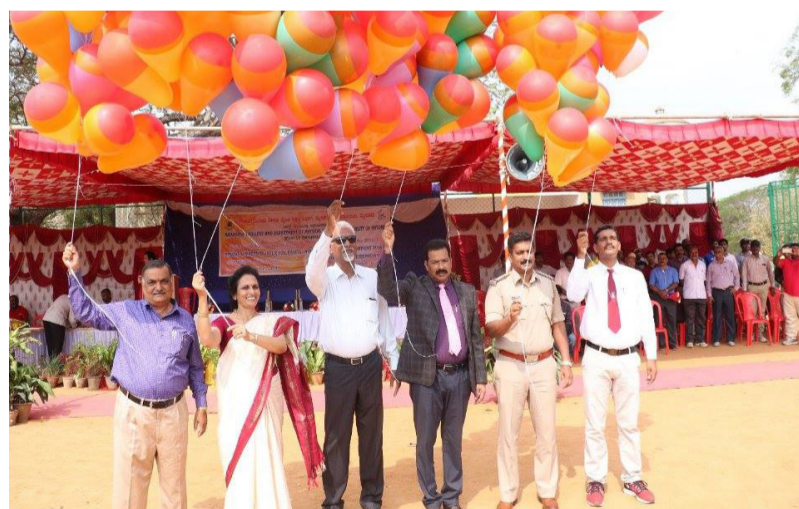
Dignitaries flag of Inter-College Sports Event at the Sports Pavilion in Mysuru.